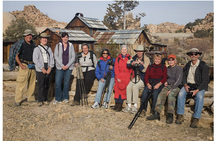
Joshua Tree Photo Shoot