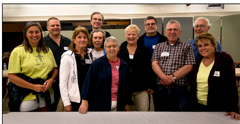
Student Showcase Judges: