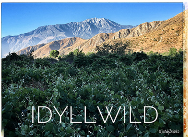
(View of Idyllwild from Whitewater Preserve, California. Sandy Zelasko)

I spent only a day in Whitewater Canyon but was lucky enough to see nesting peregrine falcons and a number of other bird species. The preserve boasts a healthy population of Nelson's desert bighorn sheep as well. Looking forward to visiting again next year and spending more time exploring our beautiful state, California.