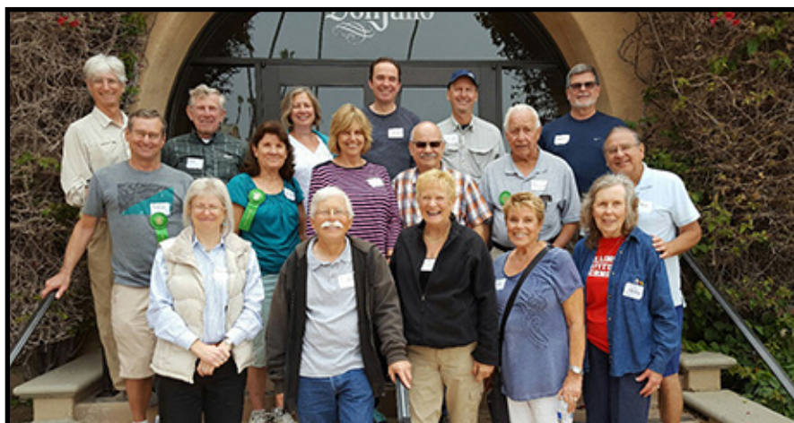
2017 NCPS Student Showcase Judges